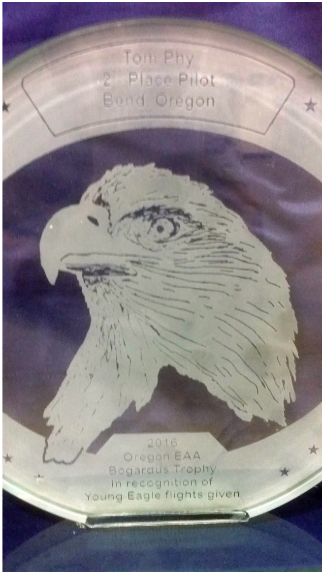
Close-up of the Tom's Bogardus Trophy